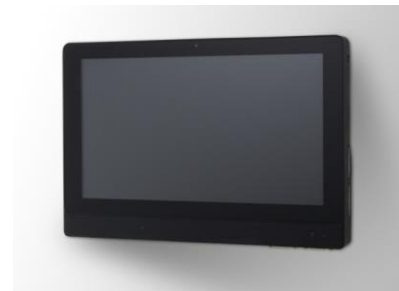
VESA Wall-Mounted *)