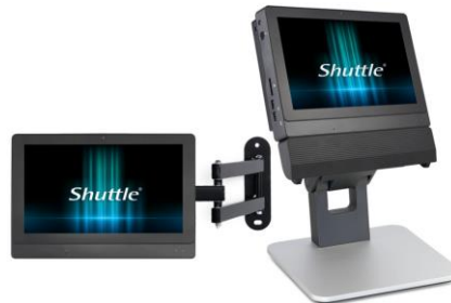
VESA Arm / VESA Stand *)