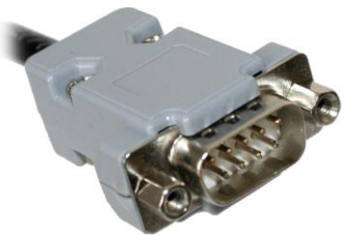
9-pin D-Sub connector