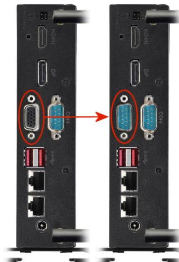
Shuttle XPC slim DS10U also DS20U, DS50U