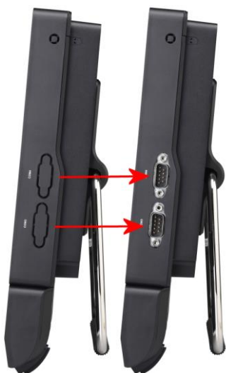
Shuttle XPC all-in-one P20U also P22U, P51U, P52U, X50V9